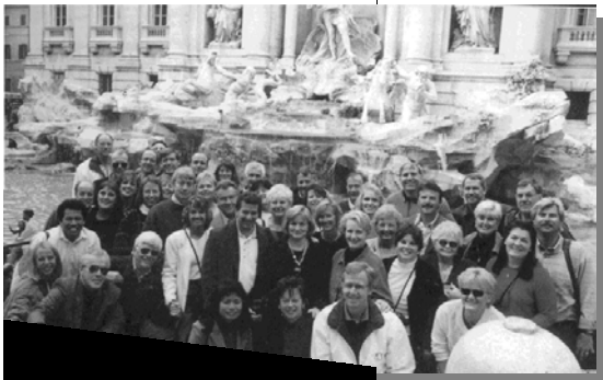
Distributors enjoy Rome and their special visit to the Vatican